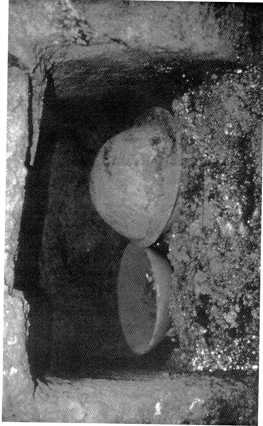
PAYSON D. SHEETS

Nested serving bowls found in a niche in one excavated structure. The bowls contain the remains of the evening meal, which villagers had consumed just before the eruption.