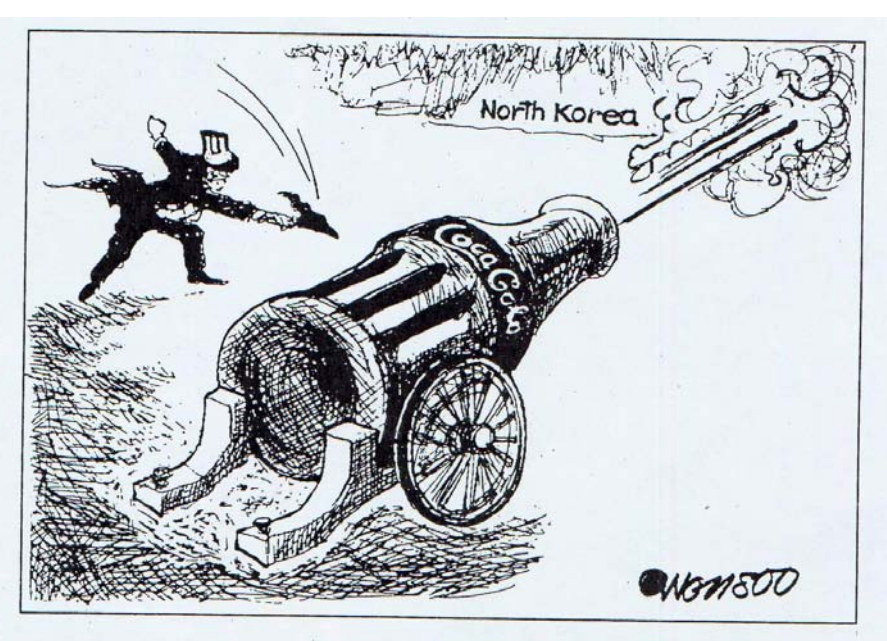
Wonsoo/The Korea Times/Seoul, Korea Cartoonists & Writers Syndicate

I will be using the Gradebook program in Blackboard. This will allow you to <u>generally</u>